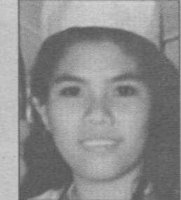
Romblon National High Marikina, Philippines, church